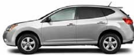
S: WITH 360° VALUE PACKAGE